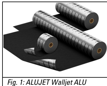
Fig. 1: ALUJET Walljet ALU

Product description ▶ ALUJET Walljet ALU consists of a composite layered aluminium structure and is used to create a horizontal seal in and underneath walls to protect against rising moisture as specified in DIN 18533-1 class W4-E.