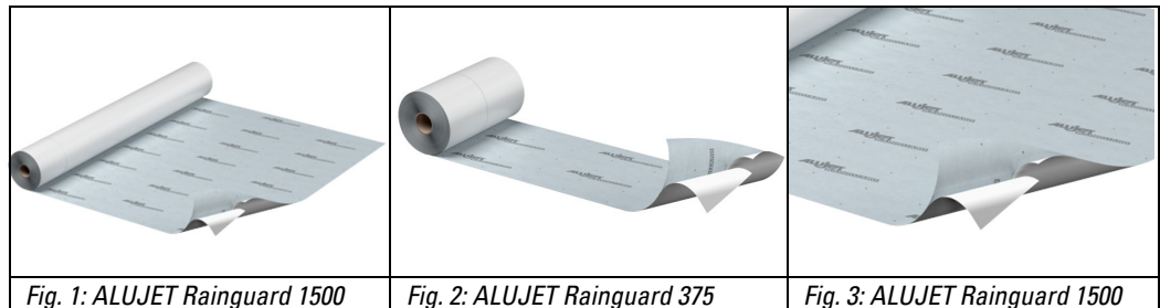
Fig. 1: ALUJET Rainguard 1500